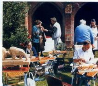
Right Members enjoy an outdoor carving session at Leigh Park Gardens.