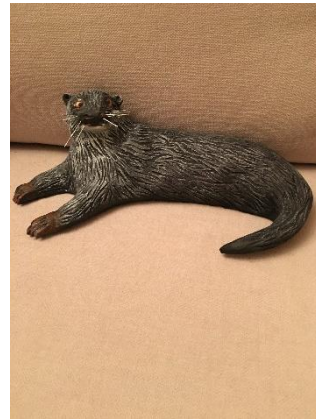
Otter in Lime painted in Black and Dry Brushed White