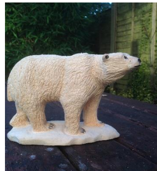
Polar Bear "Pompey" in Lime