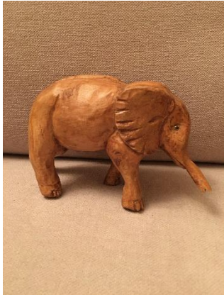
Baby Elephant in Cherry and Varnished