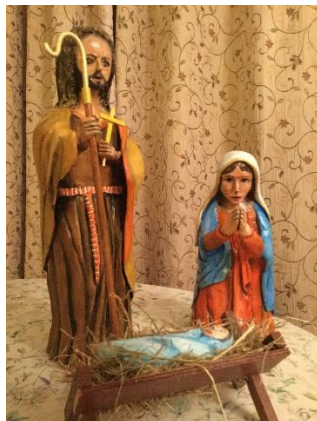
Joseph, Mary and Baby Jesus