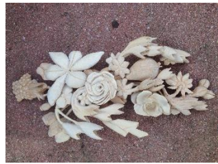
Gibbon's Style Flower Festoon