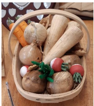
Basket of Vegetables