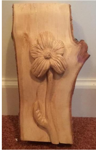
Flower in Silver Birch Log