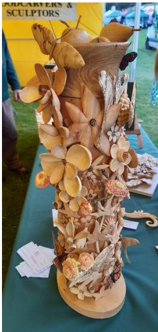
Flowers and Butterflies on Pear