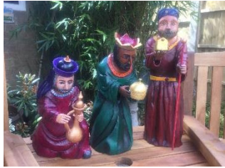
Three Wise Men