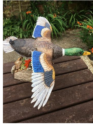
Mallard with Oak Body Cypress Lawson, Feathers Painted