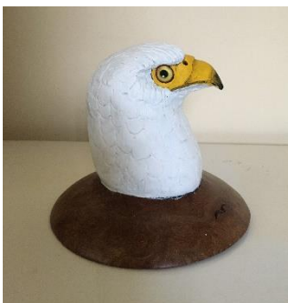
Fish Eagle in Tree of Heaven on Elm Burr Base