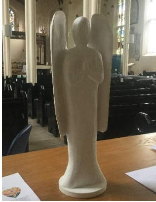
Angel in Pine