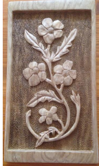
Spring in Oak