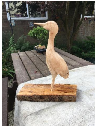
Heron in Cherry, Waxed and Standing in Water