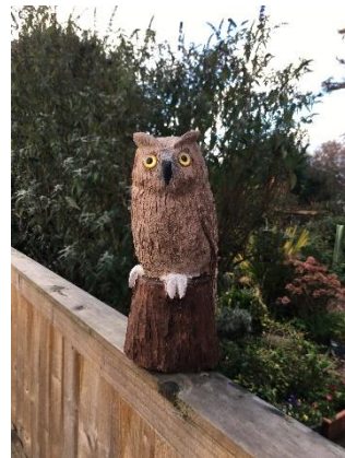
Owl in Unknown Hardwood Growing on the Bank of a Lake