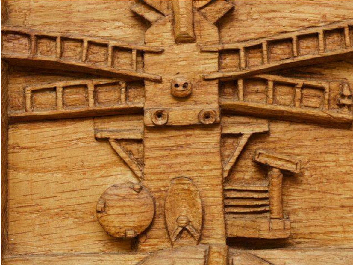
Close up of T45 Destroyer