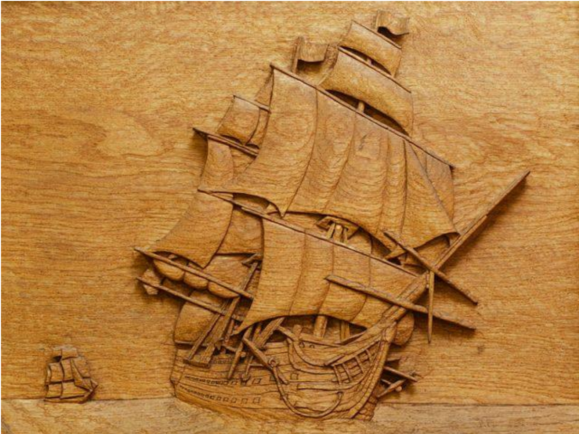
Detail of HMS Victory in full sail