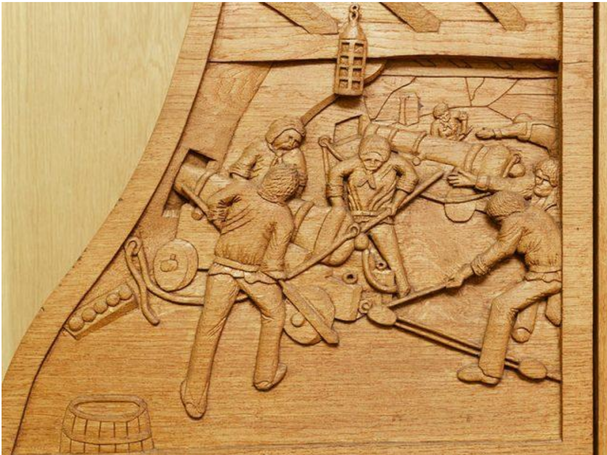
Detail of sailors on the upper deck of HMS Victory