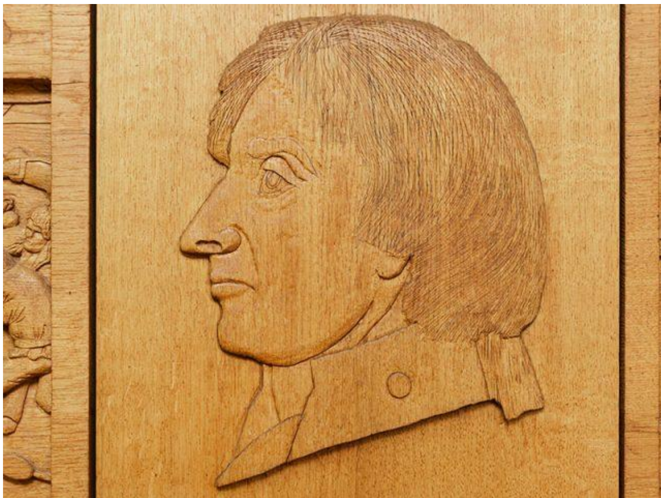
Admiral Lord Horatio Nelson

The Battle of Trafalgar was a decisive naval battle fought on 21 October 1805 off the cape of Trafalgar on the south coast of Spain during the Napoleonic Wars. The British fleet under Horatio Nelson defeated the combined fleets of France and Spain, which were attempting to clear the way for Napoleon's projected invasion of Britain.