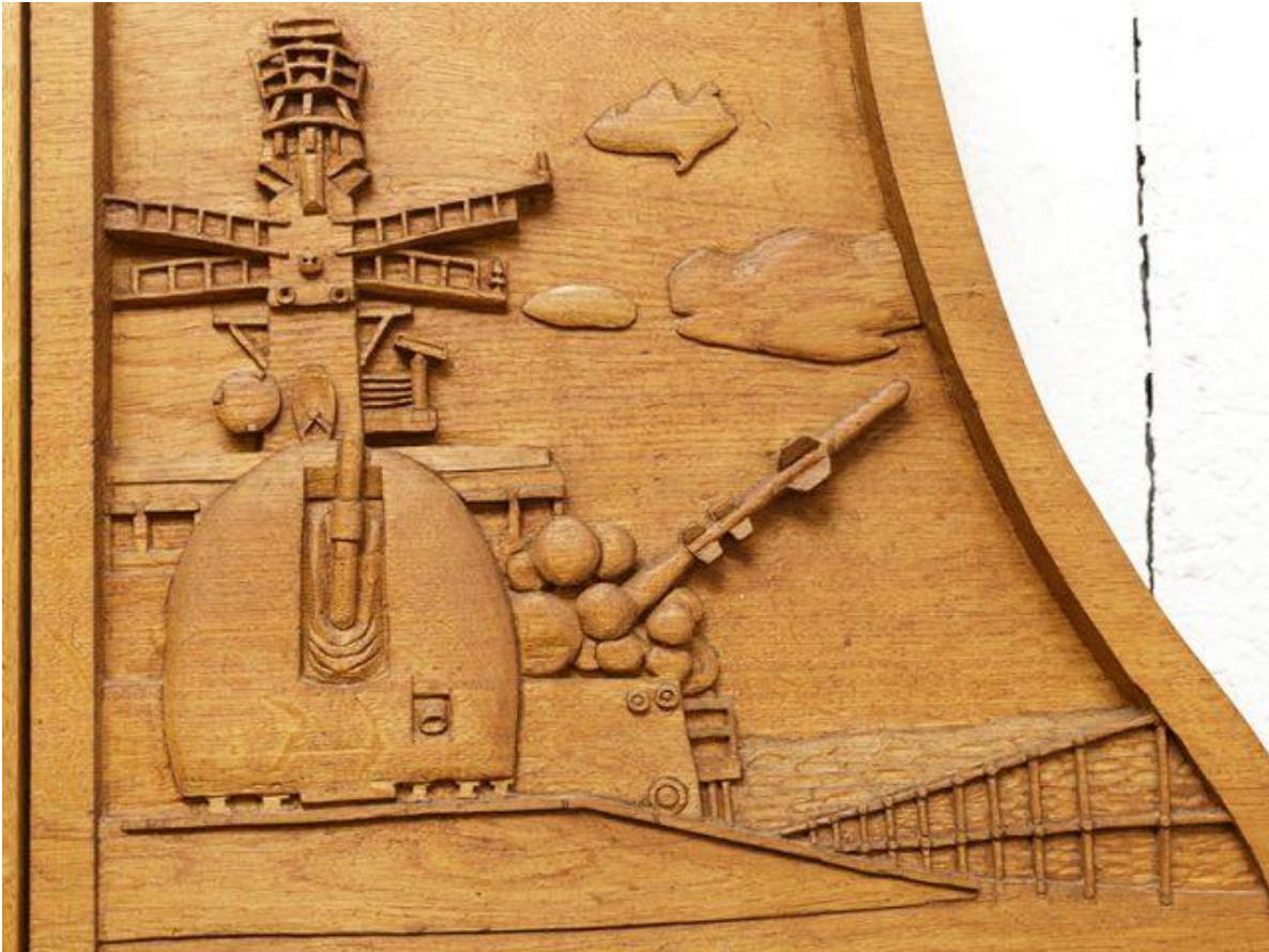
Detail of a Royal Navy T45 Destroyer