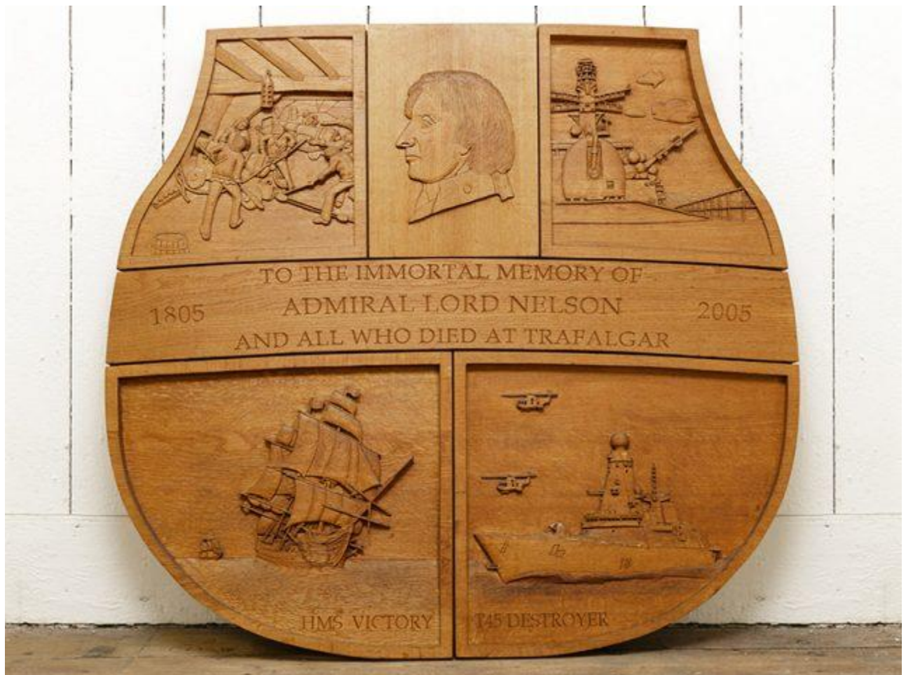
Full shield carved by members of the Solent Guild of Woodcarvers and Sculptors

Back in the mists of time, the Solent Guild of Woodcarvers and Sculptors were commissioned to create a carving to celebrate the Bicentenary of the Battle of Trafalgar. Well OK it was 2005, but in the world of the Interweb that's an eternity.